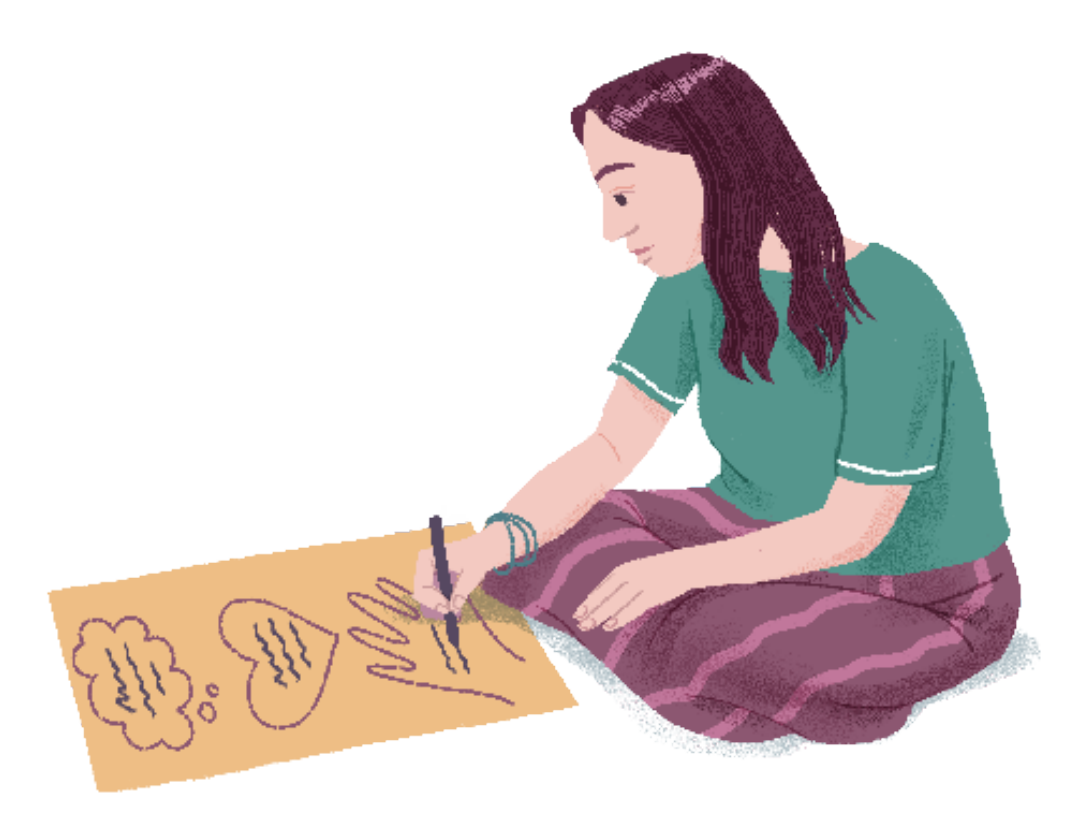
'Head, heart, hands.'

Local Changemakers Course, FORB Learning Platform, <u>www.forb-learning.org/changemakers</u>.